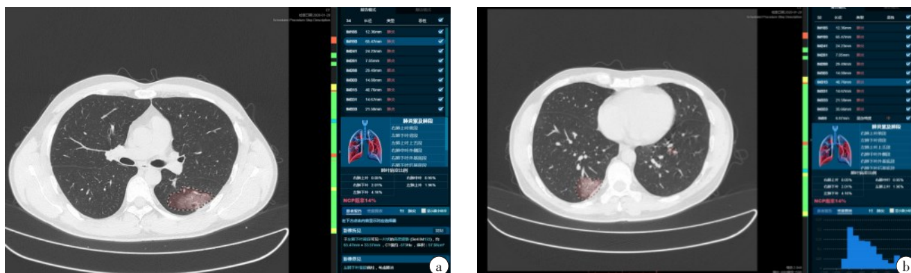
图2 男,45岁,2020年1月10日离开武汉来深圳,近3 d发热,体温达37.6℃,伴咽痒、鼻塞、咳嗽、干咳、腹泻、无胸闷,2020-1-28行胸部CT检查

a:AI识别患者有14处肺炎病变,可以在横截面上测量每个肺炎病变的大小;b:三维图像显示病变累及肺叶情况;c:AI自动计算每个肺叶病变所占体积比,测算出NCIP的疑似概率为99%;d:对于部分小病灶(箭头),AI未能识别